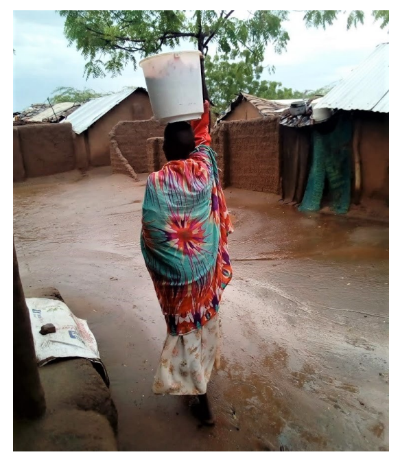
A Sudanese refugee mother takes her food home.