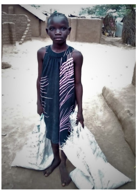
A young girl is ready for her food donation.