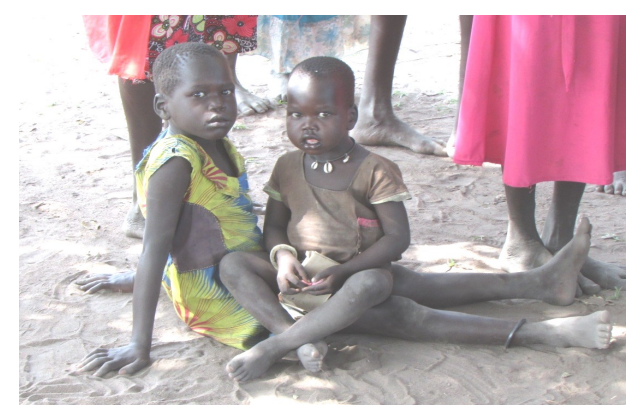
Two children waiting for relief.

On learning of the immediate need for funds for food, Medical Teams World immediately sent $5000 for food purchases. That amount purchased over 3 tons of grain that was distributed to 2,000 refugees the following weeks.