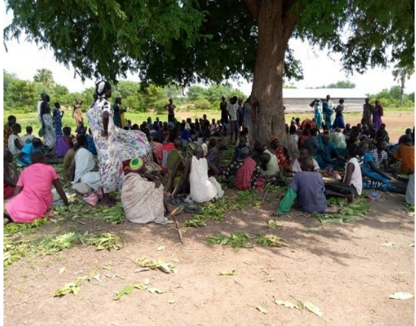
Sudanese Refugees rest under the shade of a tree.