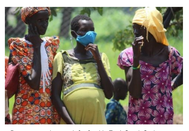
Pregnant mothers wait for food in Tonj, South Sudan

South Sudan has had immense humanitarian needs stemming from many years of armed conflict starting with a 10 year war of independence followed by a 5 year civil war. Millions live in displacement camps all over the country. The recent civil war occurred mainly between the two biggest tribes in South Sudan, the Nuer and Dinka tribes. However, smaller armed tribes, and their militias, hold a significant resentment due to appearing to be left out of the peace plans. These recent events compound long held existing tribal strife and conflicts. The country has been plagued for decades by ethnic clashes over land and cattle and blood feuds.