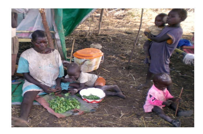
A mother prepares plant leaves for tea to decrease hunger.