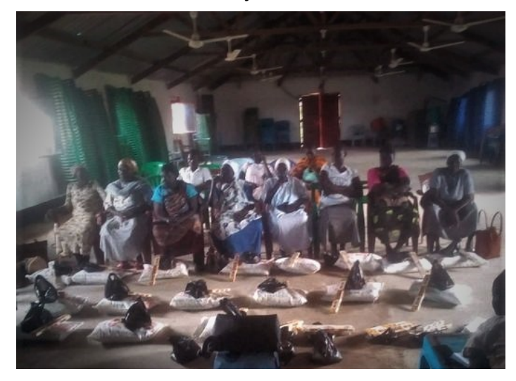
Widows and mothers receiving food relief near Juba, South Sudan

a common occurrence, pitching one large armed tribe against another in battles that may leave dozens to hundred's killed with villages burnt to the ground. These conflicts only amplify the displacement of families into unofficial "Internal Displacement Camps". One such camp with thousands of members exists in Tonj, South Sudan. Medical Teams Worldwide has a small base in Tonj working with In Deed and Truth Ministries. Food insecurity has also been amplified by last winter's massive locust clouds that devastated crops in Africa.