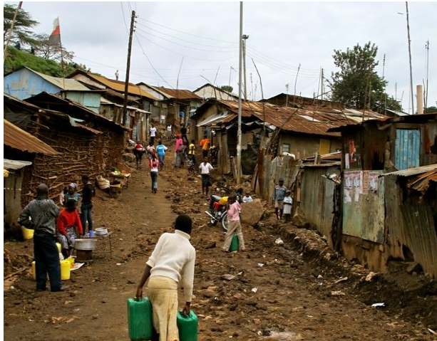
50% of the informal workforce of Nairobi lives in Kibera slum ; 80% of residents have no electricity

On March 13 th , the first COVID-19 virus case occurred in Kenya. Five days later the government locked down the country by closing all the open air markets, (thus closing the main food source for many people), all large gatherings and closed the airports. The enforcement of the lock-down initially was quite brutal with the police force attacking any large gatherings using clubs. The lockdown is still in place today. There is no movement into or out of Nairobi, the capital. After the onset of the lock-down, panic buying occurred. Food shortages developed, and now widespread unemployment. As Kenya has no social safety