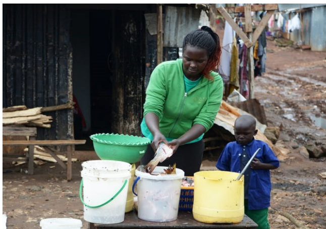
Kenyan Informal worker washing vegetables for sale