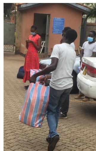
Homeless street children picking up a weeks worth of food