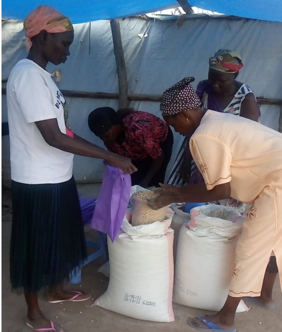
Local women distribute the food and grains.

Medical Teams Worldwide has continued to work with Charis Ministry to help the 200,000 Sudanese refugees in Kakuma camp on the Kenya-South Sudan border. Another 2 tons of food was distributed this summer.