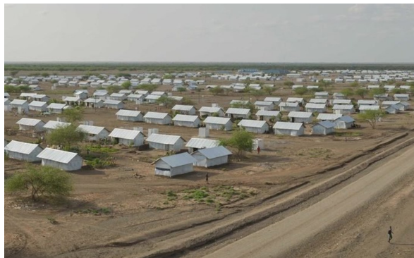
Kalobeyei Refugee Settlement, population: 38,000