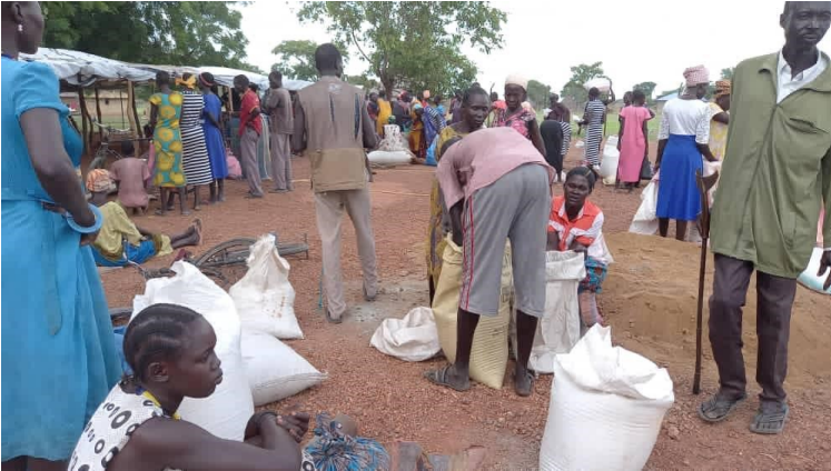
The food distribution of 5 tons of food begins.

MOST OF THE FAMILIES FORCED TO EAT LEAVES TO STAVE OFF HUNGER HAVE NOT HAD TO CONTINUE THAT PRACTICE. THE SECOND FEEDING OF 10 TONS OF FOOD ENABLED THOSE LAST FAMILIES TO HAVE ENOUGH FOOD TO EAT.