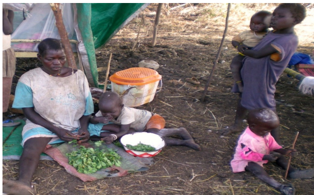
Fewer families need to eat leaves due to the food distribution.