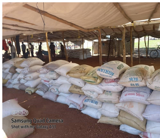
10 tons of food and grain waiting for distribution.

South Sudan has continuing immense humanitarian needs stemming from many years of armed conflict starting with a 10 year war of independence followed by a 5 year civil war. Right now, South Sudan faces the most challenging period, with a converging crises including its highest-ever levels of food insecurity, repeated rainy season floods, and armed conflict between local tribes and finally the COVID-19 pandemic. The number of people in need of humanitarian assistance is 8.3 million – more than 70% of the population. Over 60% of the population is projected to face crisis or worse levels of food insecurity. In fact, 6 communities totaling 30,000 people are at risk for famine. Meanwhile, intertribal violence has increased the number refugees to over 1.6 million. Thousands of people still shelter in displaced people's sites across the country, too afraid to return home. Women and girls who are dis-