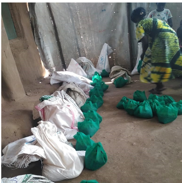
A Sudanese refugee mother helps divide up family sized portions of food and grains in sacks .

“ One family had not had food for 3 days . They were very glad for the food donated by Medical Teams World wide donors. “