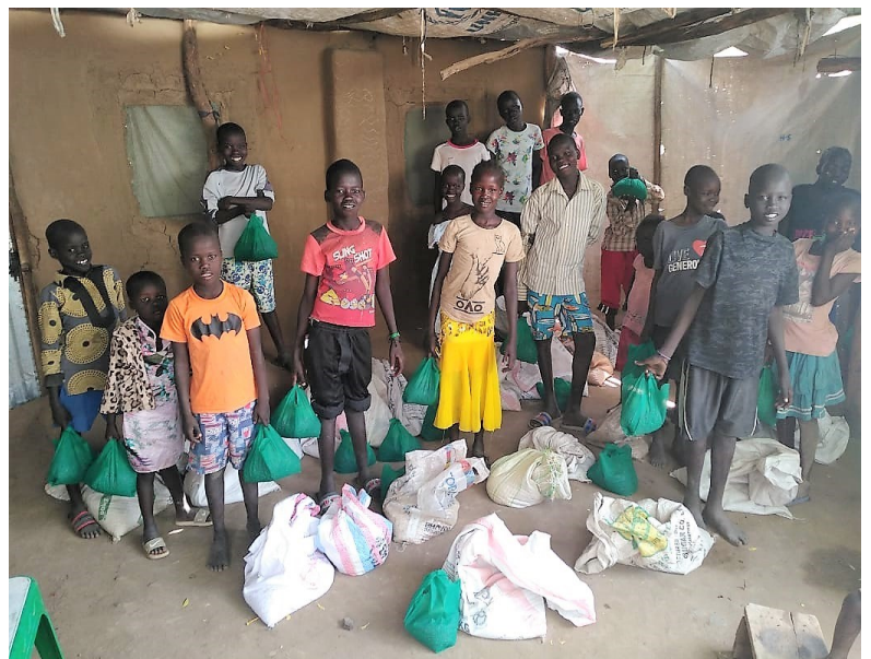
A group of children are happy and proud of their food portions.