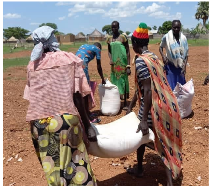
With big families 2 people need to carry the food to their family.

In Tonj, South Sudan Medical Teams Worldwide has a small base working with In Deed and Truth Ministries. The local fighting has stopped and some of the refugees have returned home. However, there are still approximately 2,000-4,000 refugees in the area. Some international aid has reached the area, but local tribal chiefs made up lists of people only from their community members and not the refugees living under trees. This is where your donations have made a huge difference. With In Deed and Truth Ministries on the ground, the donations you made purchased food that directly was distributed to the IDP's (Internally Displaced People) / refugees. In fact, this spring Medical Teams Worldwide made another large donation that facilitated the purchase of 10 tons of food that fed 1000 families ! Thank you to our donors. Most of the refugees are forced to live on one meal a day, happily the number using leaves to stave off hunger has lessened significantly, but there are still some desperate families that need to continue that practice.