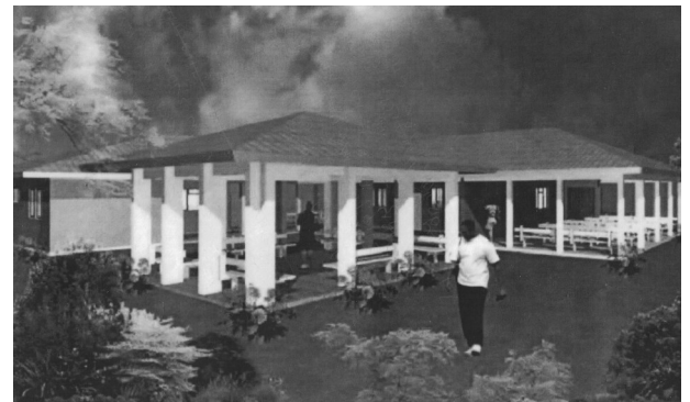
Possible clinic design for Kalobeyei Refugee Settlement

Due to the recent South Sudan Civil war refugees poured into Kakuma refugee camp. As a result, the Kalobeyei Settlement was created to unload Kakuma Camp which was at 300% of its capacity. Kalobeyei settlement houses 38,000 refugees. Medical Teams Worldwide is assessing the medical needs of the refugee camp. We will coordinate with the UN administration to find the areas of most need. Above is an example of a local medical clinic we have designed for rural areas of Africa.