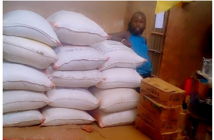
A refugee child smiles and relaxes on the sacks of grain.

“ One family had not had food for 3 days . They were very glad for the food donated by Medical Teams World wide donors. “