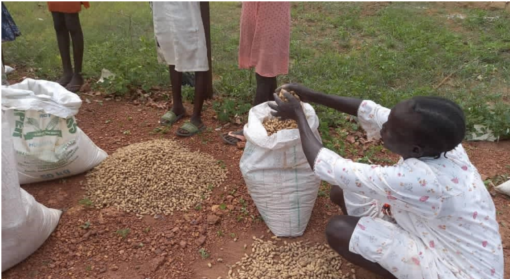
A child lets the sorghum grain flow through his hands.