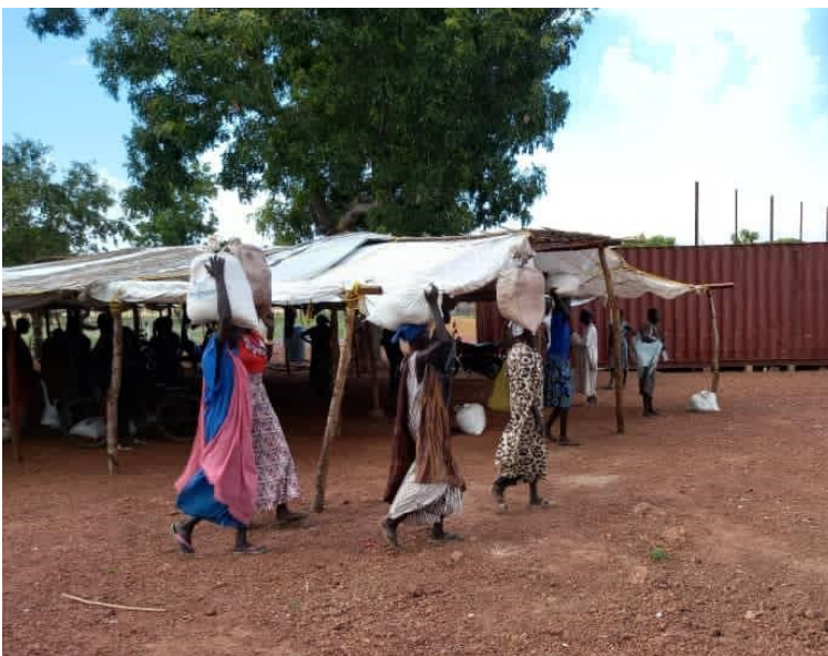
Mothers carrying their ration of food back to their families.

proportionately affected by food insecurity are at increased risk for abuse, exploitation, including sexual violence and forced marriages.