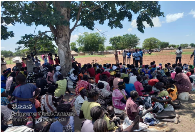
Refugees who live under trees wait for the food distribution.