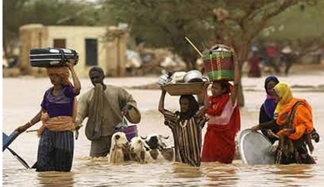
Refugees with their life possessions wading in flood waters .