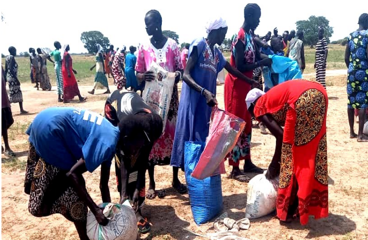
Women distribute smaller portions to single refugees.