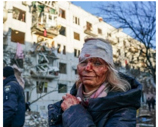
Ukrainian woman with a head wound