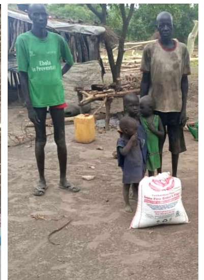
Images of Sudanese refugees with their portions of relief food after the distribution