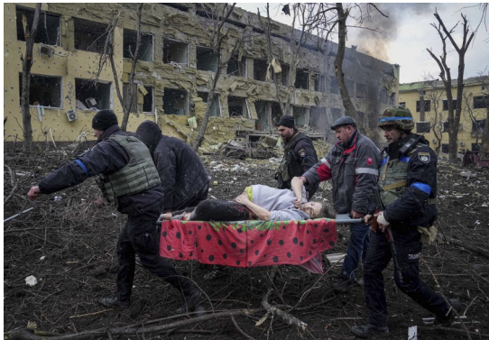
Wounded pregnant woman after a missile attack

Since the start of the Ukraine war in February, 2022 at least 12 million people have fled their homes since Russia's invasion. Of the 12 million refugees, the United Nations also states 5 million have left for neighboring countries, while 8 million people are still inside Ukraine . Approximately one-quarter of the country's total population have left their homes in Ukraine 90% of Ukrainian refugees are women and children,