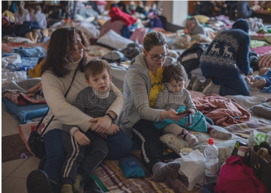
Women and children refugees without homes