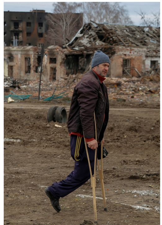
Disabled refugee walking past damaged buildings