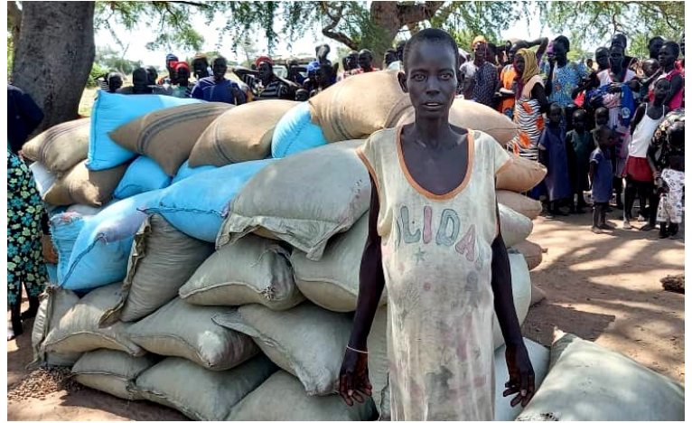
The hundreds refugees waiting for starvation relief helped unload and stack the first load of purchased grain and food