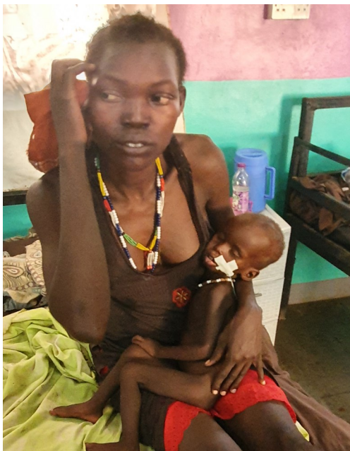
Mother with her semiconscious baby from starvation

South Sudan has had immense humanitarian needs stemming from many years of armed conflict starting with a 10 year war of independence followed by a 5 year civil war. Millions live in displacement camps all over the country. Repetitive catastrophic rain fall for 3 years caused flooding of the Nile River. These floods have further displaced up to a 850,000 refugees. Food supplies have been wiped out, schools and health facilities destroyed. With the flooding yearly planting of seeds became impossible. Presently, the UN estimates over 7 million people are at risk for starvation. In Tonj South Sudan (where MTWW works with Indeed and Truth Ministries and has a small base) the starvation has become severe. Consequently, some families are forced to eat leaves to stave off hunger.