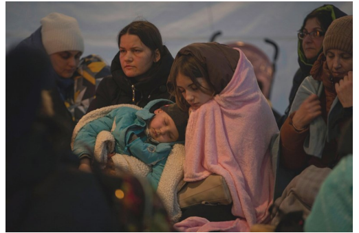
Refugees waiting in one of many lines

As the war is turning into a prolonged grinding conflict of attrition, the medical needs continue to increase dramatically. your support continues to be sorely needed.