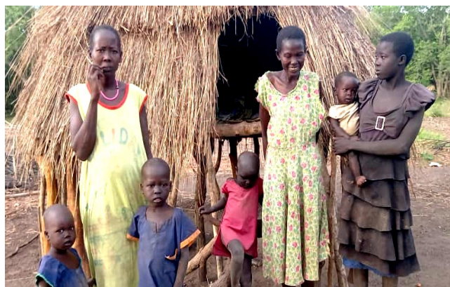
Typical family that will be helped with the starvation relief

The sorghum grain used for relief costs $50 for one , 100 lb sack or $1000/ton. MTWW was able to purchase 10 tons of food, with a $10,000 expenditure. Each bag of food can feed 2 families of 8-10 people for a few weeks . Consequently, the 10 tons helped feed 8000+ refugees. The need continues until the recent plantings can mature for harvest.