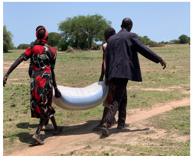
A small family carries a 100 lb sack of food