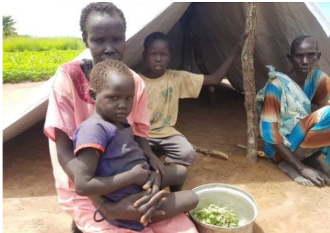
A family having to eat leaves to hold off hunger.