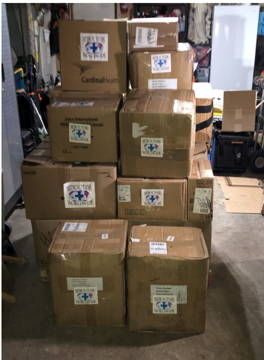
Medical Teams Worldwide next pallet for shipping