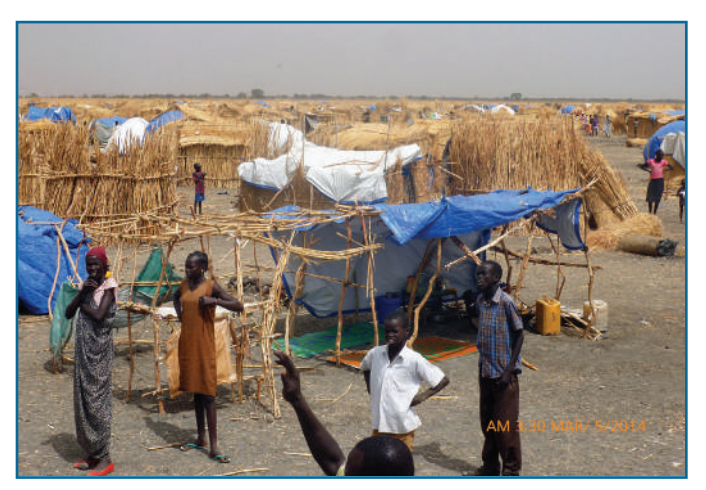
Above: 8,000 refugees from the Dinka Tribe live in grass huts