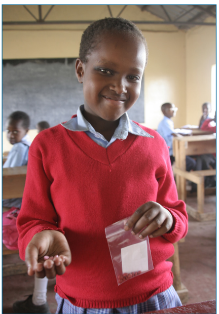
This girl shows her vitamins and worm medicine