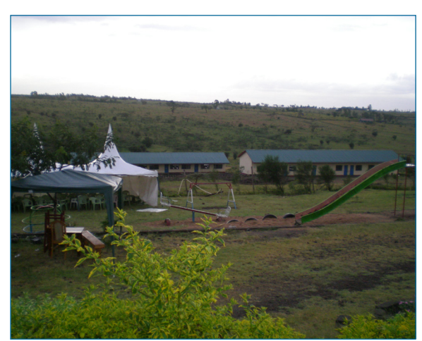
The Tamalaki School in Kiserian, Kenya teaches nearly 200 Maasai children from Kindergarten to the 8th grade