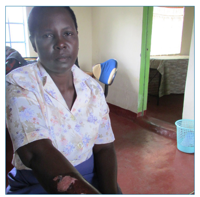
The school's cook came in with a 3 day old large second degree burn on her arm.