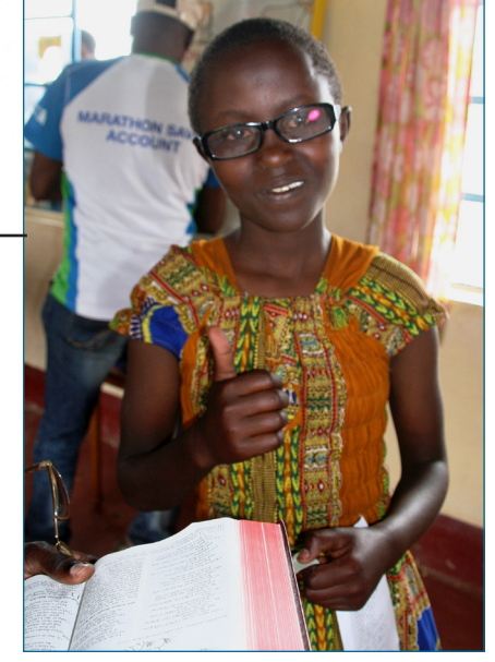
A young girl is happy with her new glasses