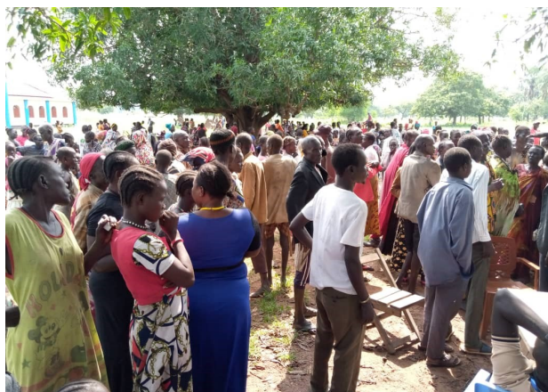
2000 refugees wait patiently for a food distribution to start