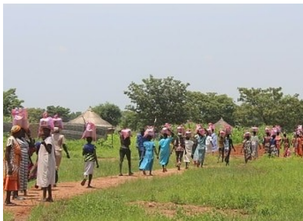
Mothers walk home from receiving the days relief food.