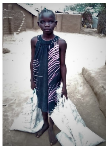
A young girl waits for her food.