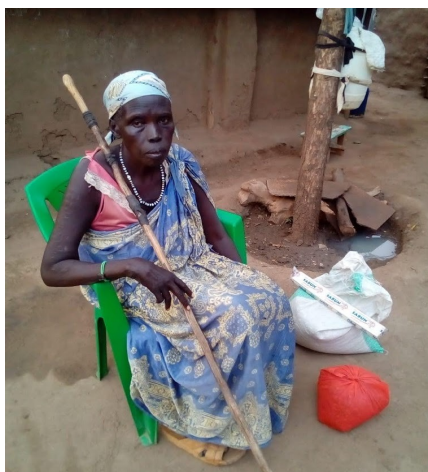
A widow shows her amount of food relief.