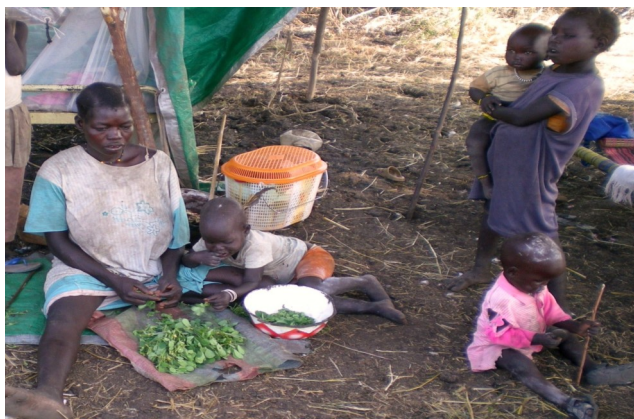
Mother prepares leaves for tea to decrease family's hunger .

In May 2020, due to multiple cattle thefts, a large battle between local tribes occurred near Tonj, South Sudan, (cattle are a family's source of wealth equivalent to our own bank accounts). Over 200 people were killed within a week. Consequently, whole villages were moved into local displaced refugee camps. Due to COVID 19 shutdowns and the insecurity for road transportation, aid convoys have been unable to reach Tonj. Thousands of women and children were near starvation. A number of families were forced to eat leaves and grass to decrease their hunger pains. Thanks to your generous donations Medical Teams Worldwide has been able to give and facilitating a total donation of $13,000 dollars that purchased nearly 8 tons of food for the 2,000 refugees in Tonj. This food will sustain the refugees for the next coming months. The starvation risk is still great. Due to ongoing Covid 19 restrictions, the usual planting season has been severely limited so next year's food availability will also be very limited. Continued support is still sorely needed.