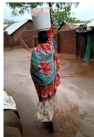
A mother takes her food