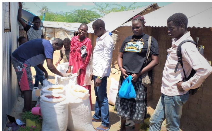
Adults and children wait for their portions relief food.

Medical Teams Worldwide has continued to work with the 280,000 Sudanese refugees in Kakuma camp in Kenya-South Sudan border. Due to the generosity of our donors Medical Teams Worldwide was able to purchase and distribute nearly 5 tons of food along with soap bars and deworming medicine for 5,000 children. With Covid 19 the needs still are acute so any further donations are greatly appreciated.