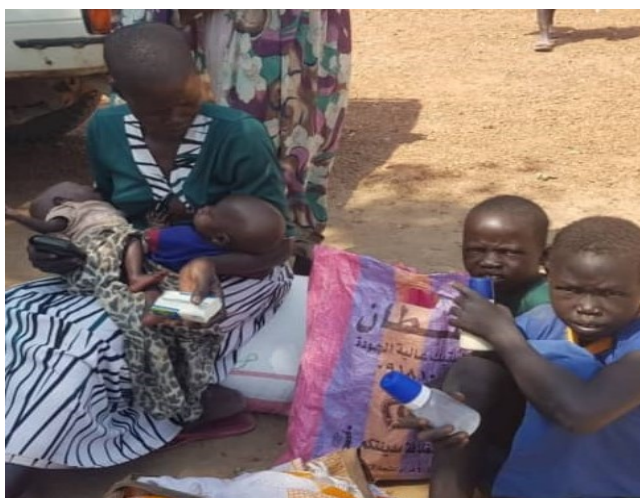
Mother and children with their relief supplies and food .